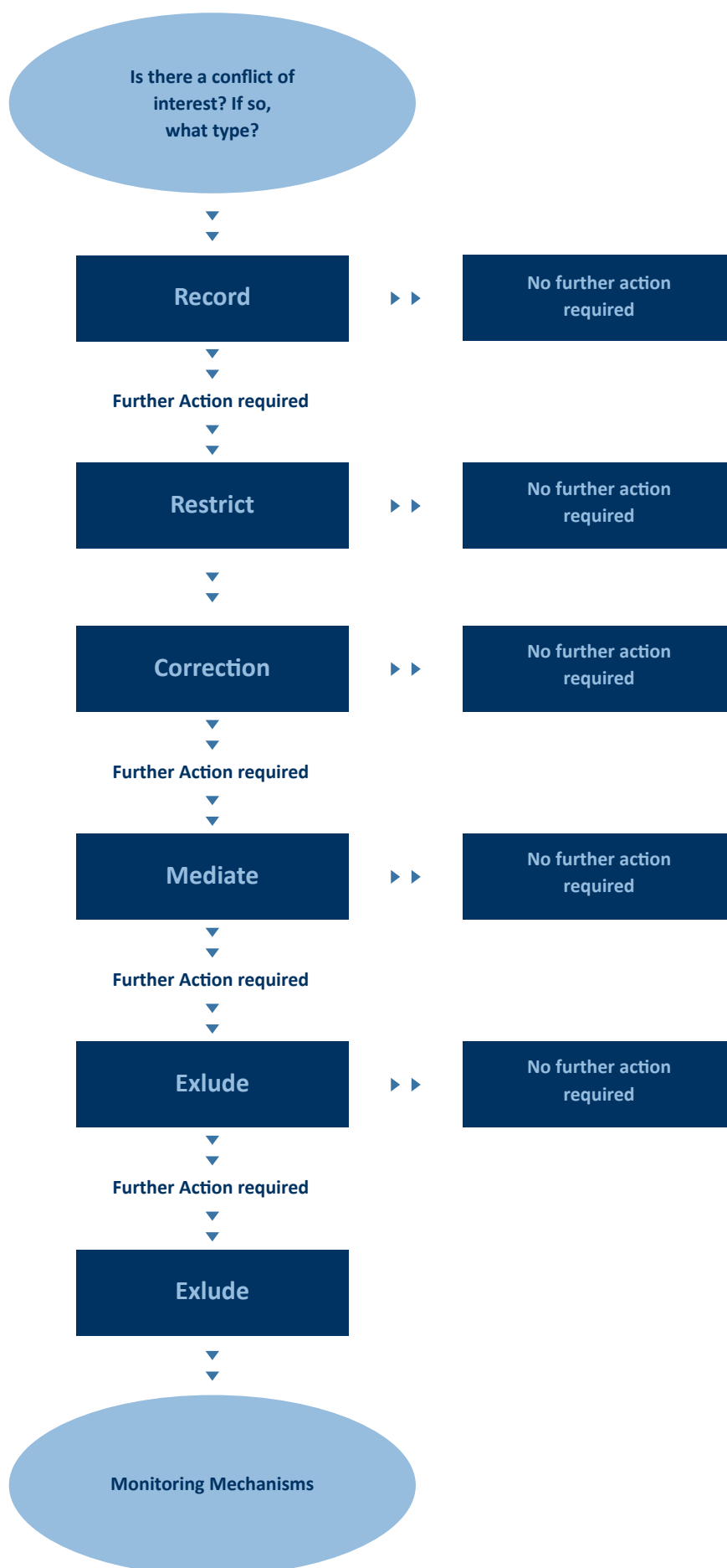
Figure xv – Decision Tree Adapted from the Crime and Misconduct Commission and The ICAC (2004)