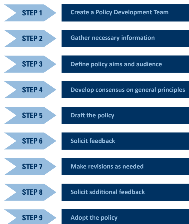
Figure iii – Steps for developing a conflict of interest policy